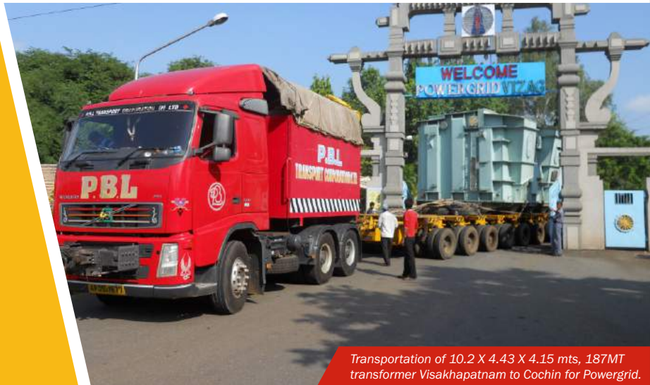
Transportation of 10.2 X 4.43 X 4.15 mts, 187MT transformer Visakhapatnam to Cochin for Powergrid.

PBL is a name which has become synonymous for safe and satisfactory delivery of goods, a familiar name for custom made solutions in the field of transportation and material handling across India. Over the years the PBL Group has evolved and grown exponentially to become an organisation to reckon with. With a rich legacy, a progressive outlook and a consistently superior track record, the Group remains committed to excellence and delivering satisfaction to its customers.