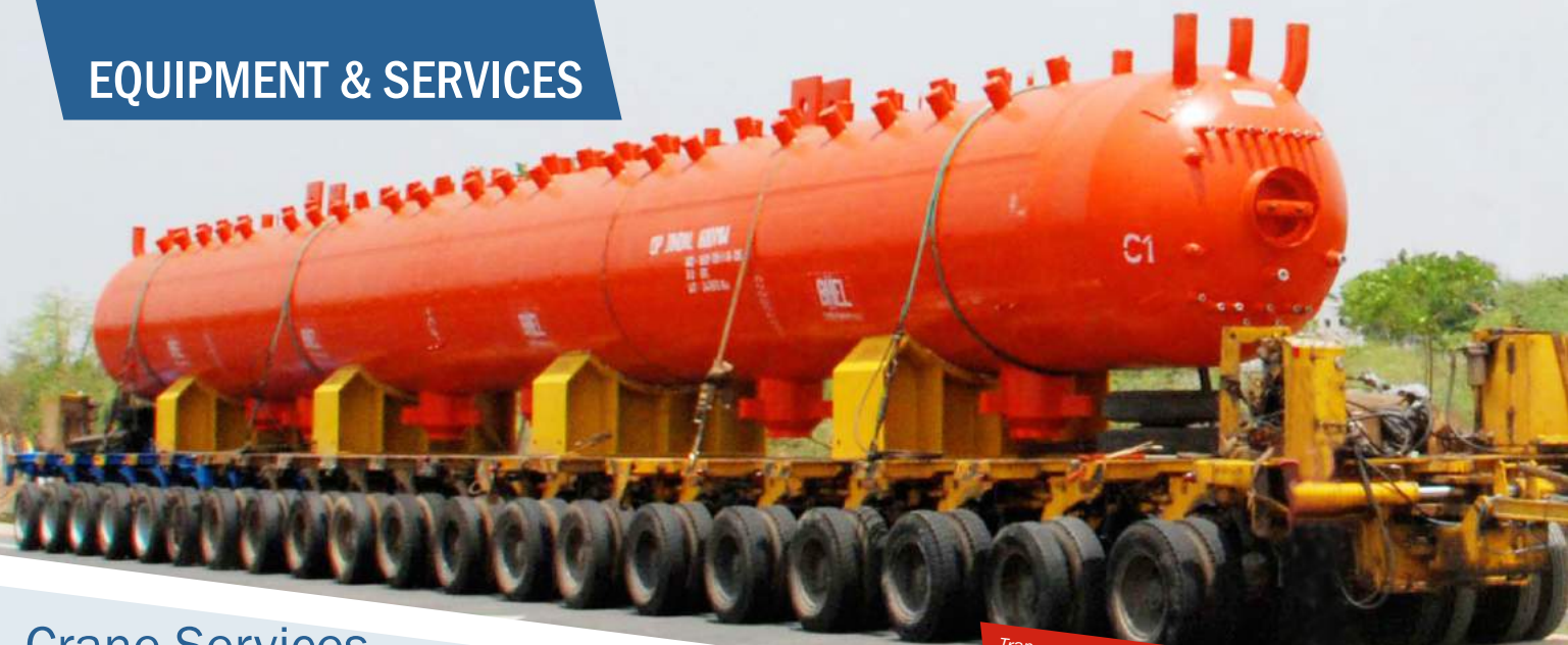
Transportation of Boiler Drum – 27.99 x 2.088 x 2.67mts from BHEL Trichy to O P Jindal Raigarh