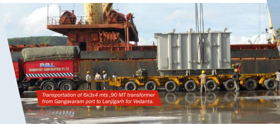
Transportation of 6x3x4 mts ,90 MT transformer from Gangavaram port to Lanjigarh for Vedanta.