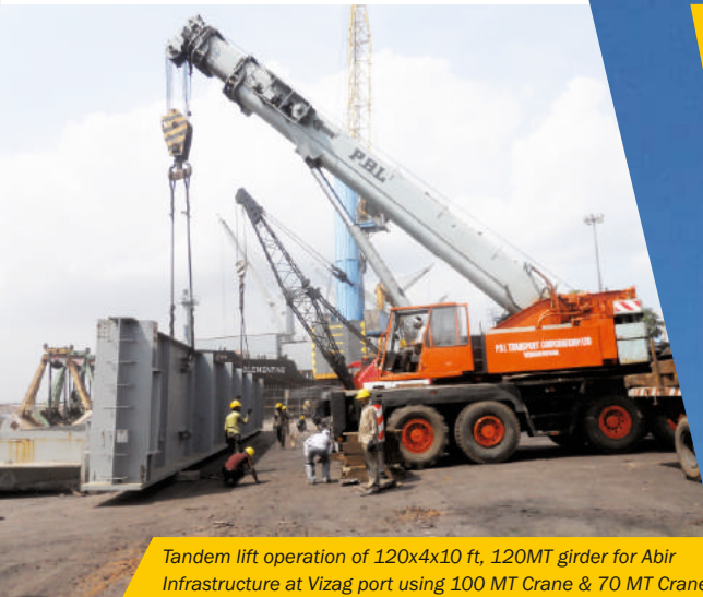
Tandem lift operation of 120x4x10 ft, 120MT girder for Abir Infrastructure at Vizag port using 100 MT Crane & 70 MT Crane

400 MT crane at work in Kanyakumari for Pioneer Wincon. Main boom 46 mts, Luffing Jib 35 mts, Working Radius 25 mts and Lifted weight 22 MT