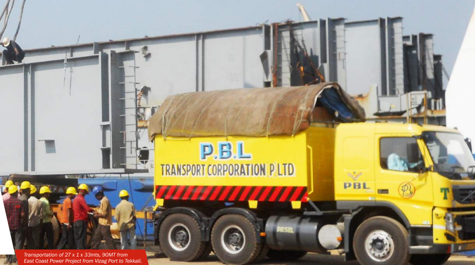
Transportation of 27 x 1 x 33mts, 90MT from East Coast Power Project from Vizag Port to Tekkali.

Our unwavering commitment to excellence has ensured that a fair amount of a business is from repeat orders and regular customers as they are not only satisfied with our services but also have full faith in our capabilities. Hence our large list of clientele includes major Government, Semi-Government, Public Sector Undertakings and MNCs.